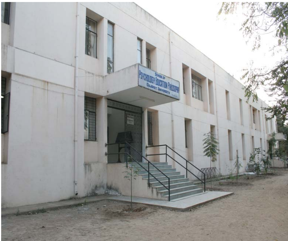
Department OF education